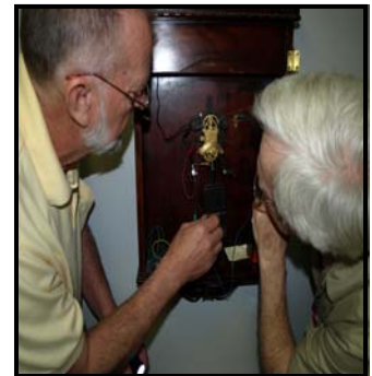
Students and instructors at the free monthly tech sections become absorbed in their projects