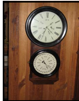
Before and after pictures of this beautiful restoration capturing first place at the NAWCC National