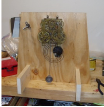
On the workbench